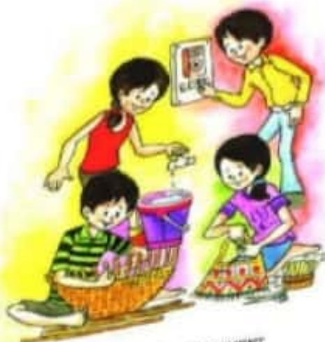
RESOURCES AND DEVELOPMENT